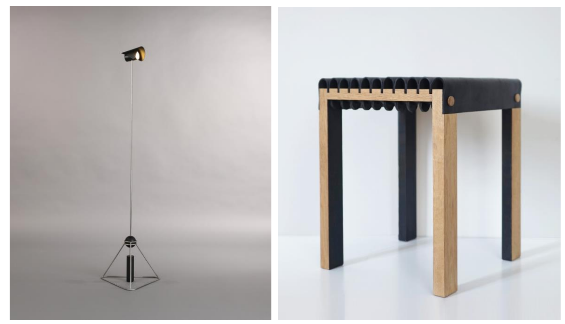
Images (left to right): Wilf Portable Floor Lamp designed by Lewis Small, The Tartufo Collection designed by Heleen Sintobin