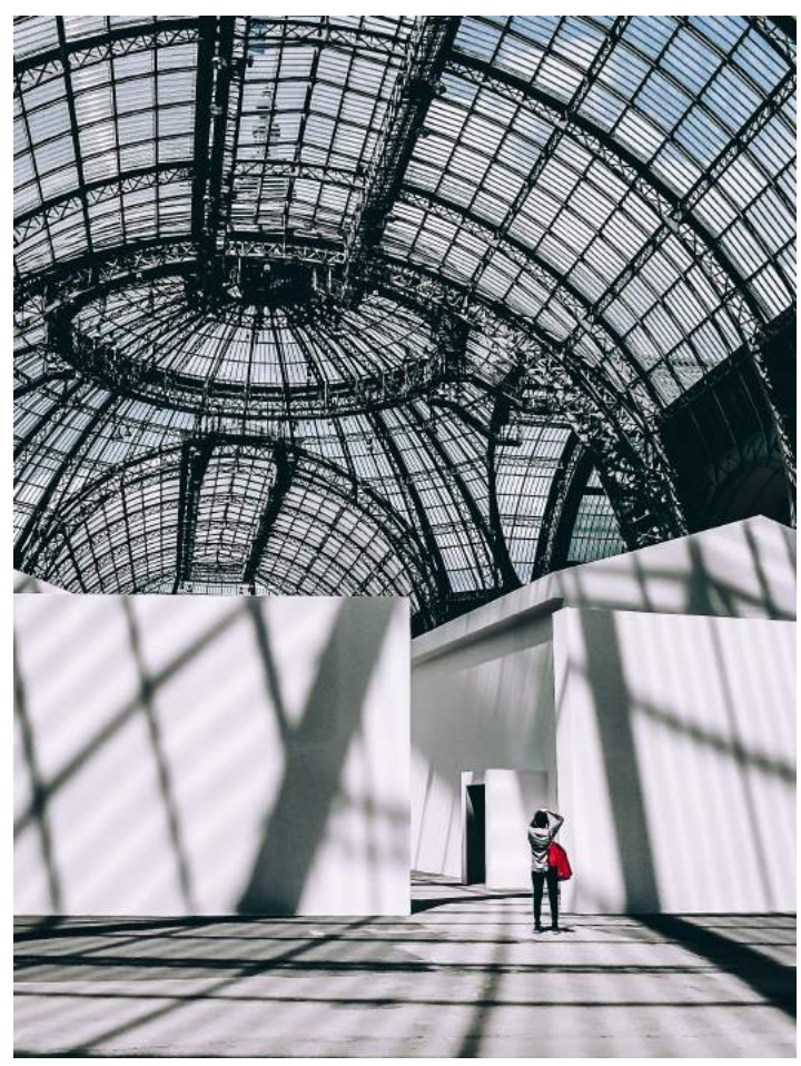
Pedro Calado - Winner of the Architecture and Light Category (amateur) 2017