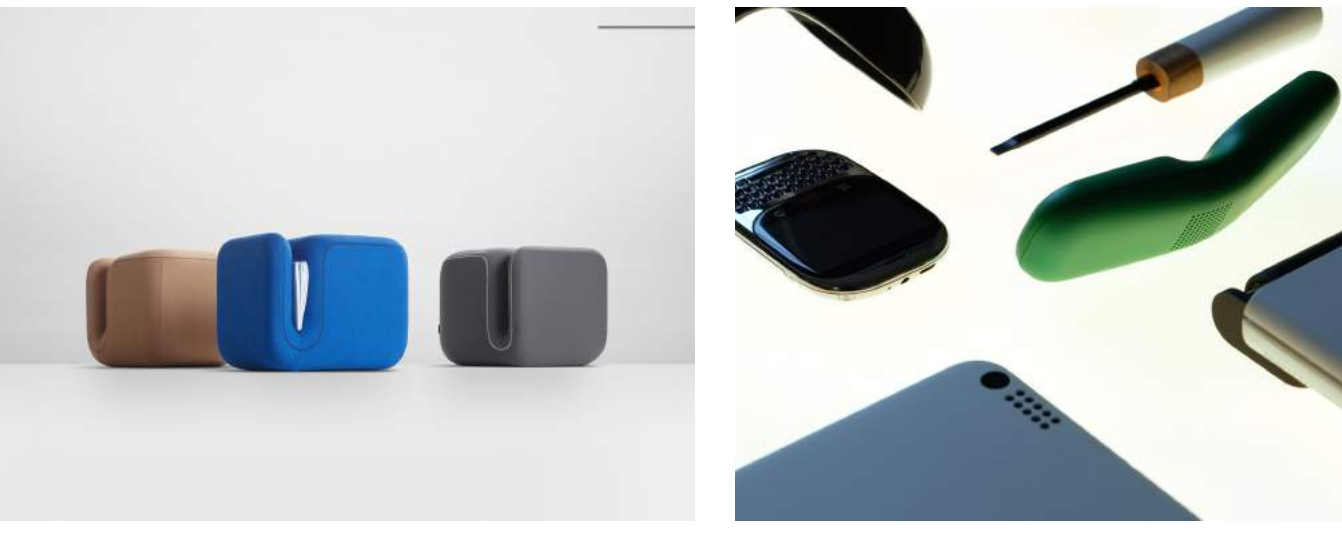
Left: Moby by Tej Chauhan for Artifort; right: SOFT POWER

Since 2005, Tej Chauhan has been mastering an approach to visual language - soft and democratically appealing yet striking and impactful. Designing to inspire broad audiences, Tej demonstrates how emotive industrial design and efficient production techniques create value and differentiation.