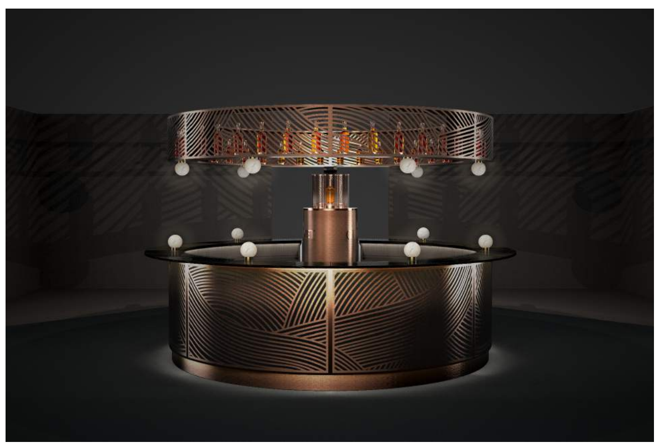
The Glenlivet Bar by Bethan Gray, Doon Street site

Bethan Gray has drawn inspiration from the Cairngorms, home of The Glenlivet , and explored the natural landscape surrounding the distillery to design a unique reinterpretation of her distinctive Dhow pattern influenced by the River Spey and the layers of mist that gather in the neighbouring valleys. The hand-stained birds-eye maple and solid copper inlay reflect the charred barrels and copper stills used by The Glenlivet in the whisky making process.