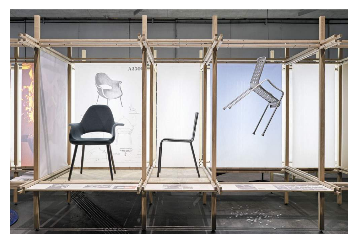
'The Original. About the power of good design' installation by Vitra

Flooring creatives, Bolon will launch nature-inspired collection, Elements, in an exhibition showcasing the company's commitment to sustainability. Subtle and versatile, the Elements range reflects the textures of the natural environment and is inspired by materials such as linen, oak, ask, cork, birch and marble. The exhibition will highlight Bolon's two new sustainable initiatives, Closing the Circle and Cradle to Cradle with NoGlue®, and reflect on its history of environmental consciousness which started when its founder, Nils-Erik Eklund began making woven rugs from vinyl waste sourced from a Stockholm factory in 1949.