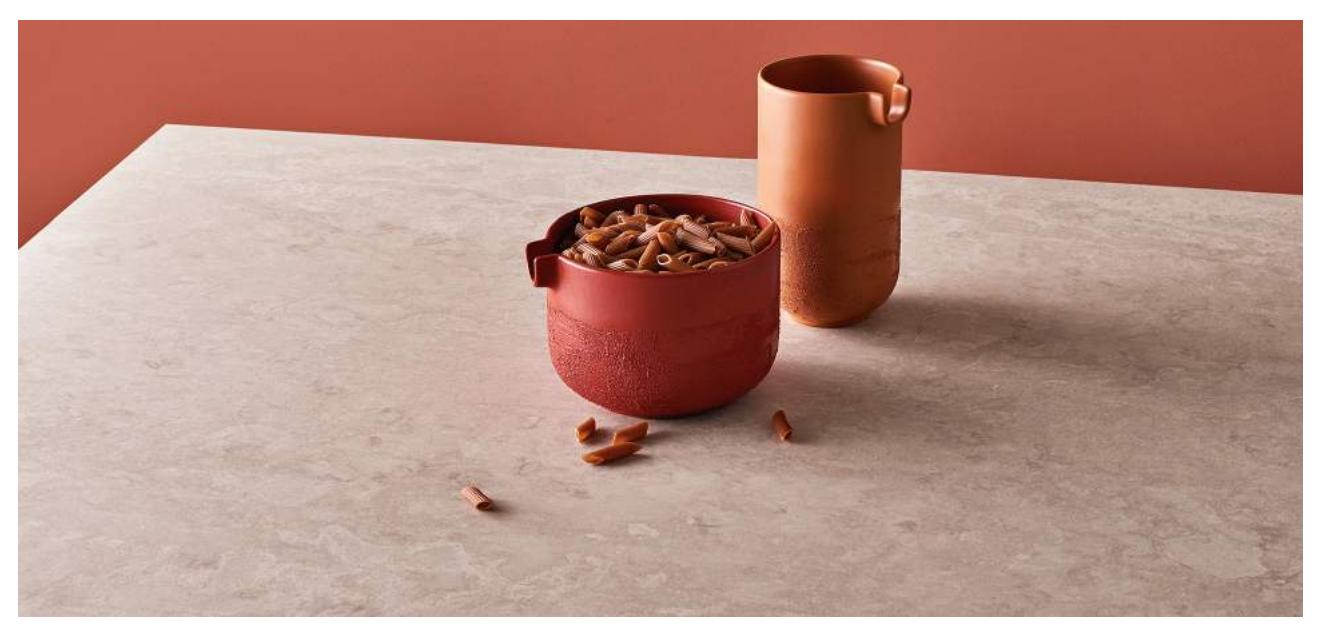
Detail of Caesarstone Topus Concrete

Surfaces experts Caesarstone also join the list of leading brands brought together for the STILL BY FORM restaurant project. The brand has used its newly launched Topus Concrete for the restaurant's main bar. Developed as part of the design teams wider exploration of industrial finishes and weathered patinas, Topus Concrete's gentle linear