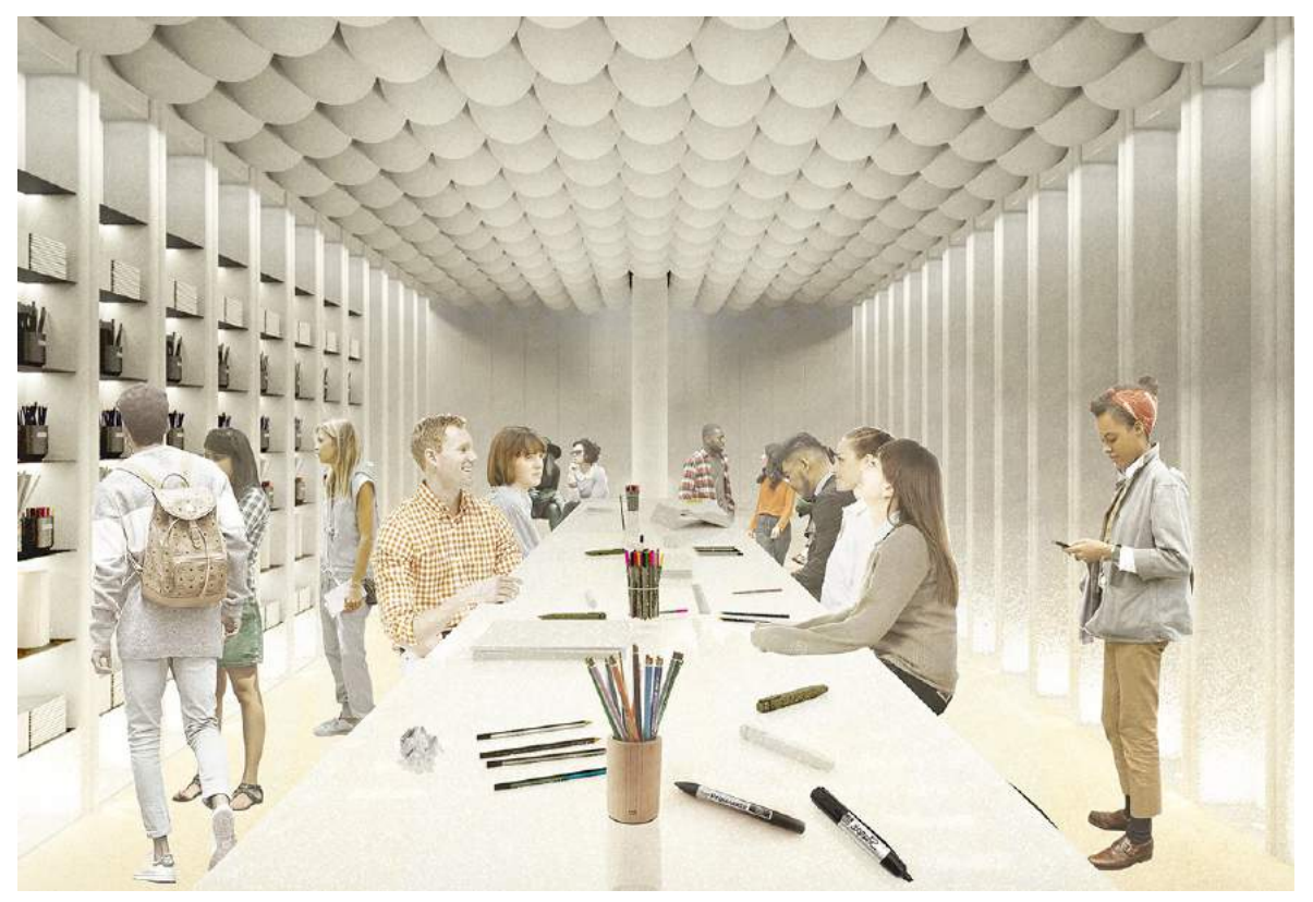
Co-working space designed by Squire and Partners

This September, 'The Architect's Toolkit' project will launch at designjunction as part of a co-working space designed by award-winning, Brixton based architecture practice Squire and Partners, using acoustic panels by We Design Silence. Relating to Stephen Lawrence's unrealised dream to become an architect, Squire and Partners' installation creates a highly stimulating dreamscape environment in which core design tools are unlimited, and people from all generations and backgrounds can meet, work and create together. The space will be an active feature within the show where designers will host interactive workshops and connect young designers with industry leaders.