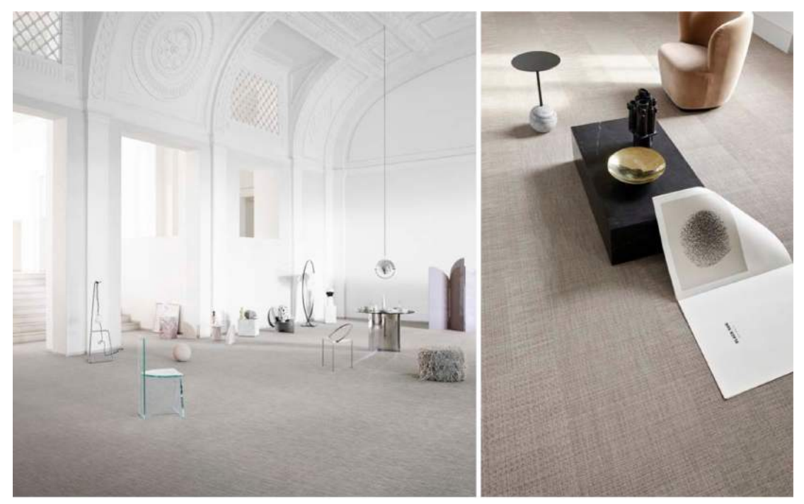
Elements Collection by Bolon

Flooring creatives, Bolon will launch nature-inspired collection, Elements, in an exhibition showcasing the company's commitment to sustainability. Subtle and versatile, the Elements range reflects the textures of the natural environment and is inspired by materials such as linen, oak, ask, cork, birch and marble. The exhibition will highlight Bolon's two new sustainable initiatives, Closing the Circle and Cradle to Cradle with NoGlue®, and reflect on its history of environmental consciousness which started when its founder, Nils-Erik Eklund began making woven rugs from vinyl waste sourced from a Stockholm factory in 1949.