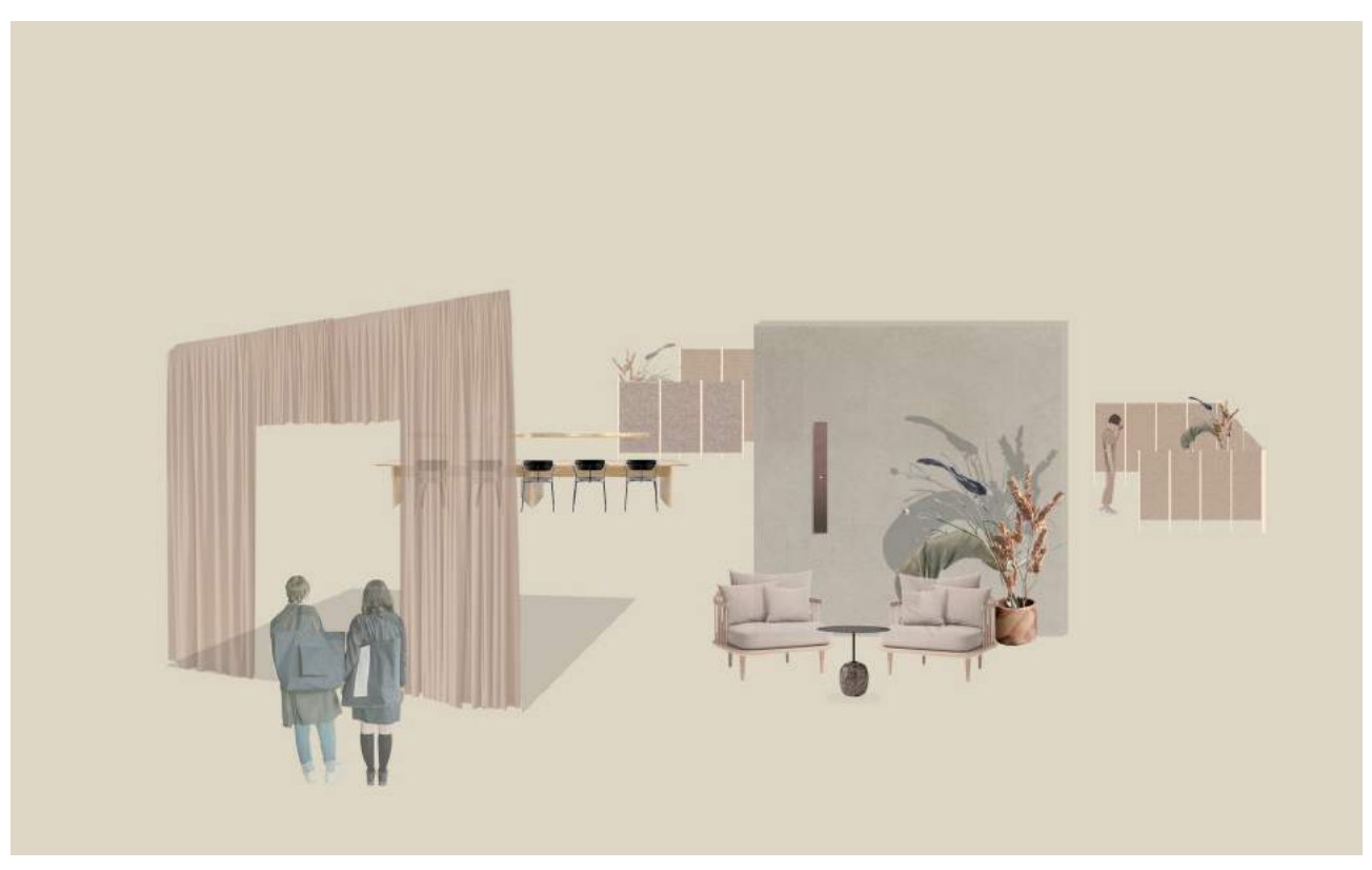
STILL BY FORM Restaurant

The pop-up restaurant features a refined collection of design across lighting, textiles, surfaces, furniture and new materials, including brands; &tradition, Anour, KABE Copenhagen, Zilenzio and Atkinson & Kirby. The menu will be provided by Nordic inspired 26 Grains , the name refers to the number of ancient grains that are used to produce simple, healthy food.