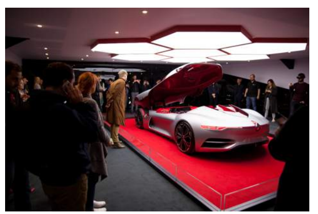
Above: Rado Star Prize UK presented in The Crossing; and Renault TreZor concept car on Granary Square