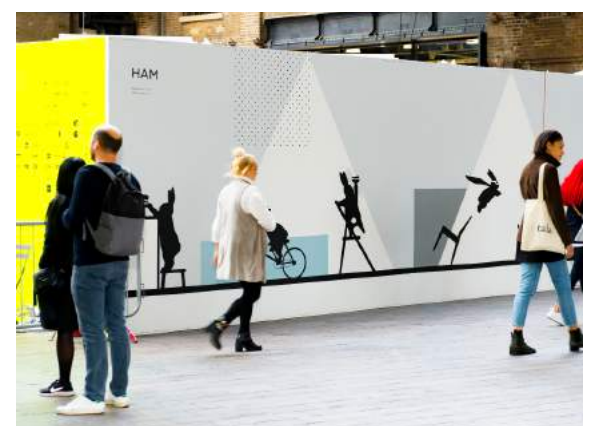
Above: Kickstarter x ASSEMBLE presented SPLATWARE by Granby Workshop and HAM's bespoke bunny mural welcomed shoppers, both at The Canopy