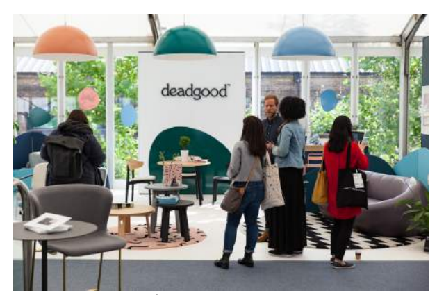
Above: Design House Stockholm and Deadgood both in Cubitt House | ©Ruth Ward