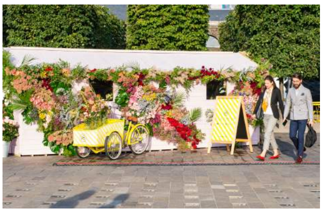
Above: The Box Office by Remote Possibilities; and bloomon's immersive flower tunnel both on Granary Square | ©Ruth Ward