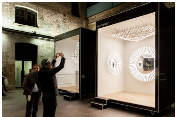
Above: Tala in Cubitt House and Blackbody x Haviland showcases its Helene: Light and Porcelain chandelier in The Crossing

Also on display was the careful curation of decorative lighting including newly established brand Tala , who launched the world's largest sculptural bulb, Voronoi . Blackbody showcased their light and porcelain collaboration with fellow French brand Haviland whilst LG Display exhibited its OLED light panels, and launched the LG OLED Design competition encouraging emerging and established designers to enter.