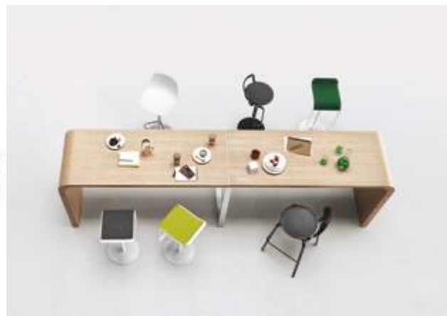
Above (from left): Morgan furniture, La Palma

UK based contract furniture specialists Morgan Furniture combine ergonomics, comfort and longevity across its furniture pieces. New products launching at the show include the Goodwood and Havana seating collections.