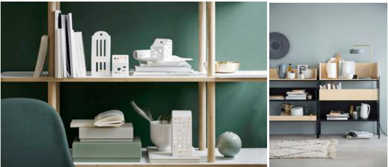
Above (from left): Kahler Design, Skagerak

Showcasing the best in Scandinavian design, Skandium will present two Danish brands at this year's designjunction: Kahler Design will make its UK debut, presenting its latest accessories range; whilst Skagerak will display new furniture collections that draw on traditional craftsmanship and materials.