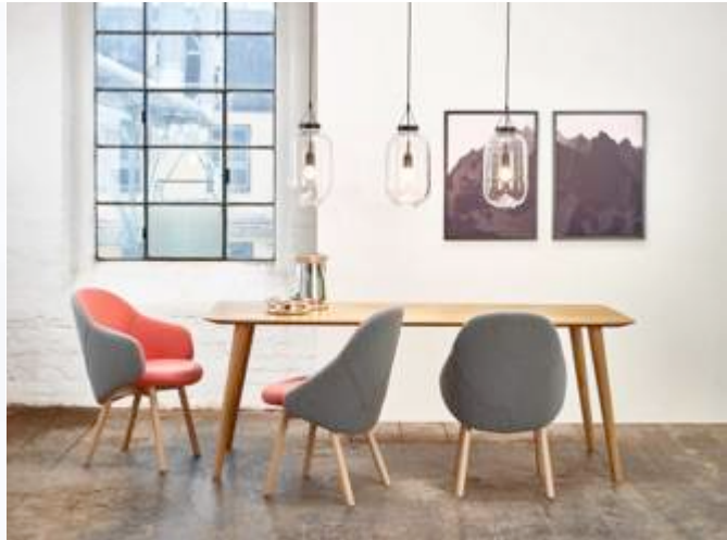
Above (from left): OMK 1965, TON

Newcomer to the show, OMK 1965 will present a new collection of refreshed iconic furniture pieces originally designed for the likes of Habitat and the Groucho Club during the 1960s. Favourites including the Omkstak chair, T1 chair and Vienna console table will be re-issued in a new palette of colours, materials and finish options.