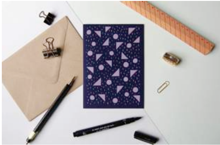
Above (from left): Papersmiths, Laura Knight Studio