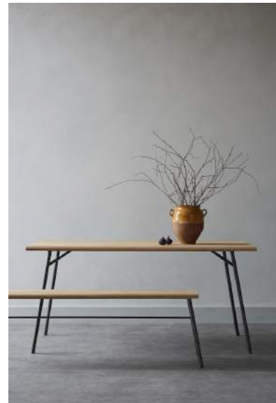
Above (from left): Dashel Helmets, Oggetto

Established this year, Koti & Co , a new online homeware and lifestyle store exhibits a variety of products from lesser known designers. Online home and lifestyle store Oggetto will showcase a collection of handmade pieces that highlight the high levels of quality and craftsmanship prevalent in each piece. Such & Such's curated selection of homeware and lifestyle goods will include a selection of concrete pendants, linen and ceramic tableware and more.