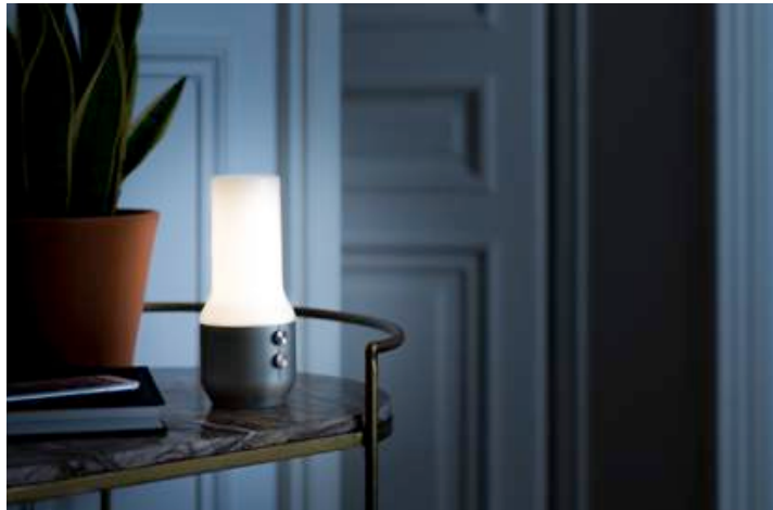
Above (from left): Koti & Co, LEXON