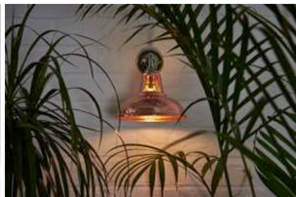
Above (from left): Marset, Artifact Lighting

Artifact Lighting will showcase its latest Coolicon Wall Light, an adaption of the iconic 1930s Coolicon pendant, whilst the new lighting collection from DI CLASSE draws inspiration from traditional Japanese culture.