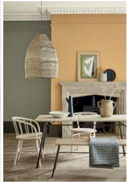
Above (from left): James Burleigh, Little Green

Little Greene , known for its eco-friendly paint, unveils seven new colours and will launch an updated palette of 184 shades. Turkish brand SOTO Lab launches the SO.05 modular shelving and cabinet unit, assembled by utilising traditional crafted joinery requiring no screws to hold the structural components together.