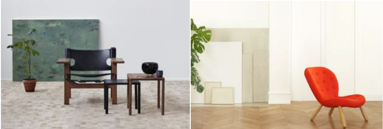
Above (from left): Fredericia, Icons of Denmark

Due to popular demand, designjunction expands its trade destination. Cubitt House remains a focused furniture and lighting destination, whilst Cubitt Park , a new pavilion located opposite, will house luxury accessories and materials, in addition to a curated mix of emerging designers.