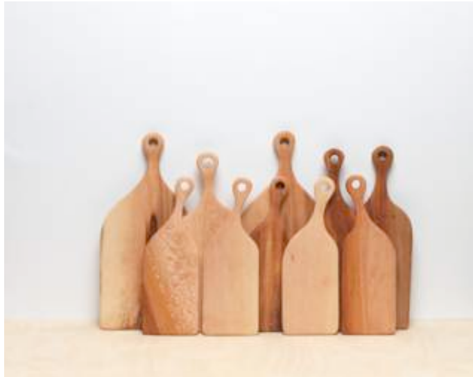
Above (from left): Tom Pigeon, Hampson Woods

Areaware will be launching its new range of functional and unusual objects including the Snake Blocks collection. Tom Pigeon's simple abstract style is inspired by the balance and rhythm of shapes, and can be seen across the brand's latest collection of jewellery, rugs, a series of sculptural mobiles, and textile pieces.