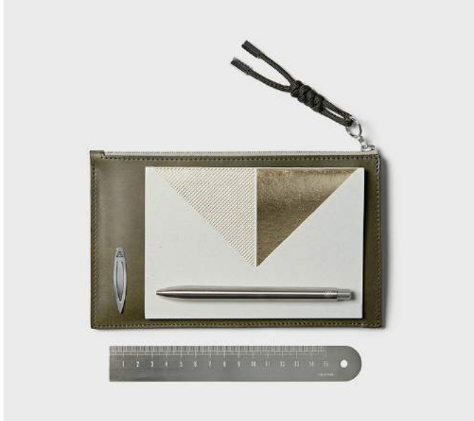
Above (from left): Someday Designs, Campbell Cole

With sustainability at the heart of the brand, Hampson Woods makes wooden products from foraged UK timber. Beatrice Larkin will expand their Monochrome Series to include three new sizes of cushions, each playing with structures, patterns and scales.